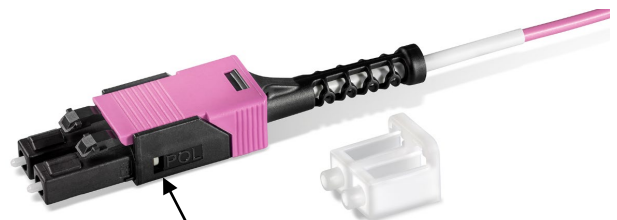
Delivery status of polarity window POL: - at this connector side (B) = white - at the opposite connector side (A) = black