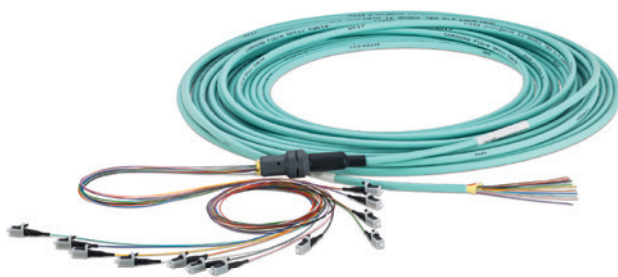
Trunk cable, pre-assembled on one side