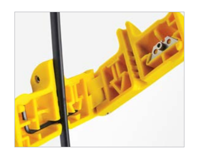
Hinged design opens to accept cable for end and mid-span applications without disassembling tool.