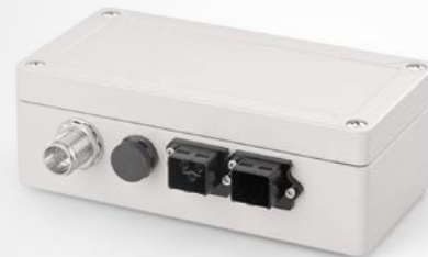
External Power Supply Unit